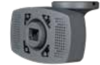
5MP Telephoto IR Bullet IPAi65A05-ZR