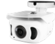
8MP Telephoto IR Dome IPAI38A08-NR